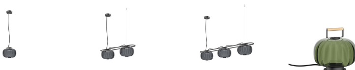
Krista D240x1 Krista D240x2 Krista D240x3 Krista T Corte de fase C Corte de fase C Corte de fase C D240x1