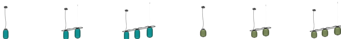
Krista D163x1 Krista D163x2 Krista D163x3 Krista D183 10W Krista D183x2 10W Krista D183x3 10W