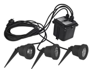
Focus 3 Light with trans