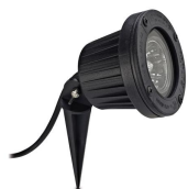
Focus 1 Light with trans