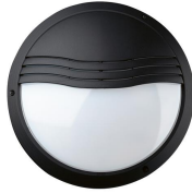
Plaff Round Hood