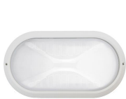
Plaff M Oval