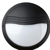
Plaff Round Hood