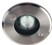
Sofito D90 Retrofit