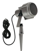
Spark No grid