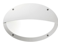
Teia W Oval Hood