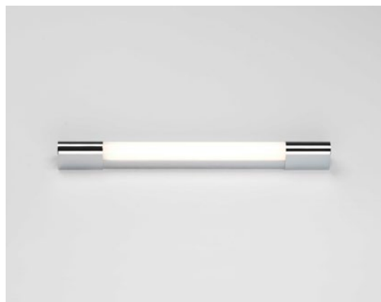
CODE: 1084021 FINISH: POLISHED CHROME

TO MAINTAIN THIS PRODUCT TO ITS BEST CONDITION, PLEASE VIEW OUR CARE AND CLEANING GUIDE ON THE SUPPORT SECTION OF THE ASTRO WEBSITE.