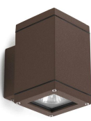
Seth Square L80 Down