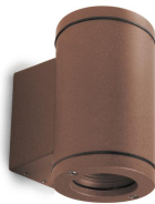
Seth Round D93 Down