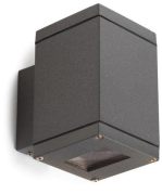
Seth Square L100 Down