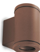
Seth Round D93 Down