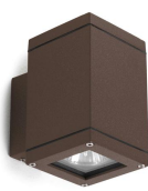
Seth Square L80 Down