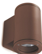
Seth Round D130 Down