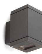
Seth Square L100 Down