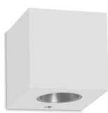
Brick Up Down