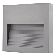
Slim Square Surf M