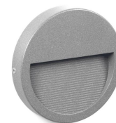
Slim Round Surf S