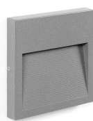
Slim Square Reces S