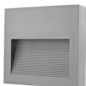
Slim Square Reces M