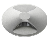
Pussa D25 2 beams