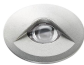
Pussa D25 1 beam