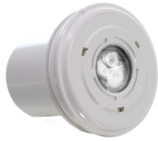
Pal R W