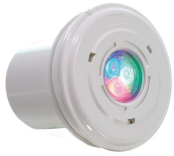
Pal R RGB