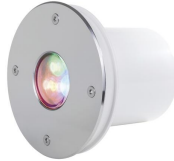
Pal slim R W