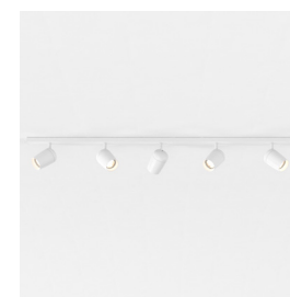
CODE: 1478016 FINISH: MATT WHITE

To maintain this product to its best condition, please view our care and cleaning guide on the support section of the astro website.