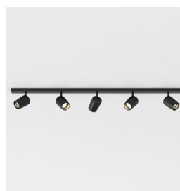
CODE: 1478008 FINISH: MATT BLACK