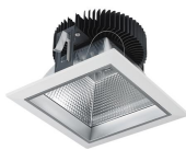
Pandora Round L Pandora Round M Pandora Square M