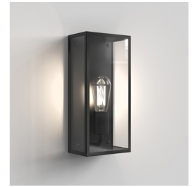
Code: 1183031 Finish: Textured Black

This product is not suitable for installation within five miles of the coast. For these environments, please filter products on the astro website by 'coastal'.