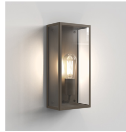
Code: 1183023 Finish: Bronze