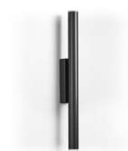
Tania W micro