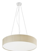
Vorada L C