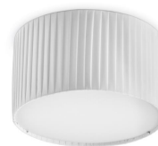
Vorada S N