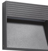
Rima Surf Square