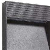
Rima Surf Square