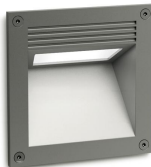
Rima Reces Square