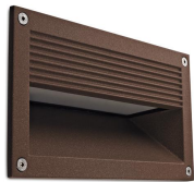
Rima Reces Rectangle H