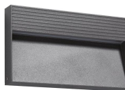
Rima Surf Rect