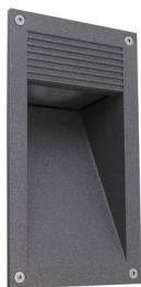
Rima Reces Rectangle V