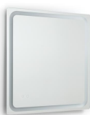
MINERVA 1000 TOUCH MINERVA 1000 TOUCH MINERVA 800 TOUCH