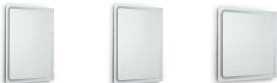
MINERVA 1000MINERVA 1000MINERVA 800 TOUCH