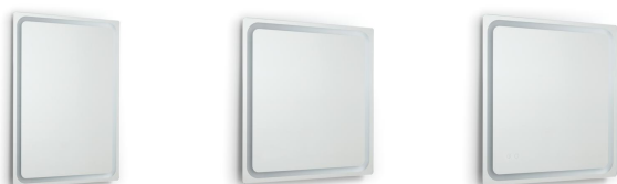
MINERVA 1000 MINERVA 800 MINERVA 800 TOUCH